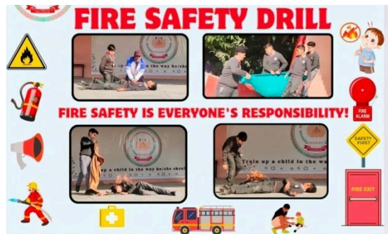
FIRE SAFETY DRILL