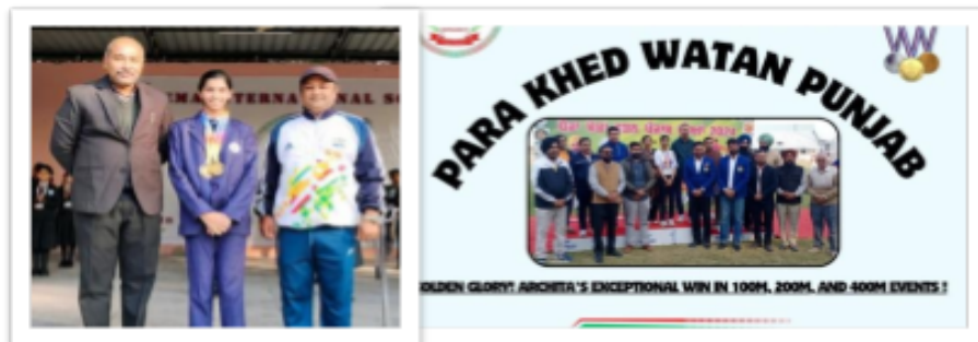
PARA KHED WATAN PUNJAB