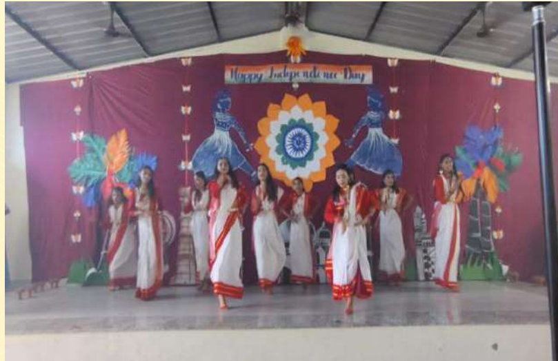
Yellow House Stood First