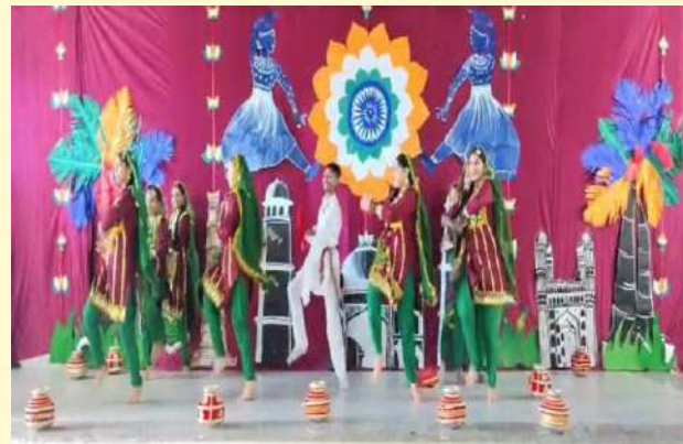
Green House Stood Third