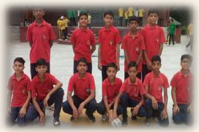
Red House Bagged Third Position

Handball is important for its comprehensive physical and mental development benefits, promoting teamwork, strategic thinking, and social skills, as well as providing a significant cardiovascular workout. It improves strength, endurance, and coordination, while also enhancing quick decision-making, problem-solving, and a sense of cooperation among players.