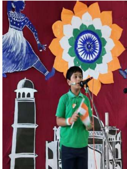
Nirvan (Green House) Stood Second