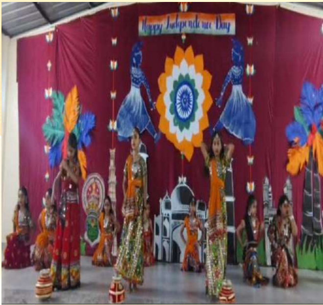
Blue House Stood Second