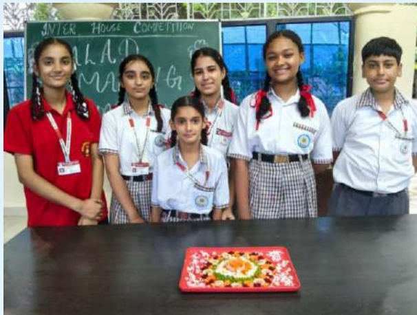
Chefs Of Red House Got Second Position