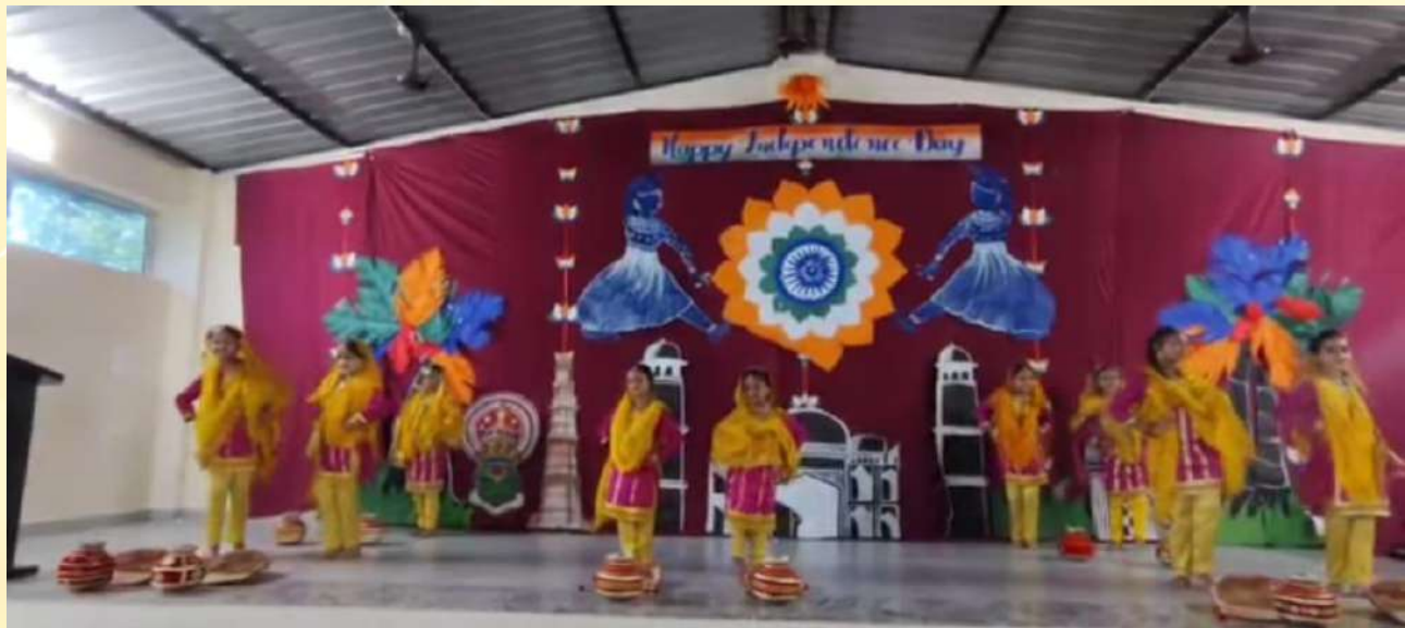
Red House Stood First