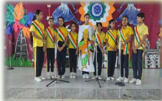
Yellow House bagged 2nd position