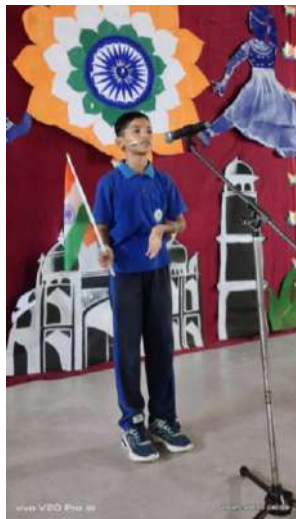
Navam (Blue House) stood Third