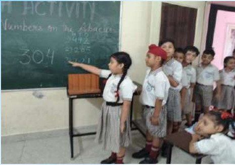
Numbers on Abacus Activity