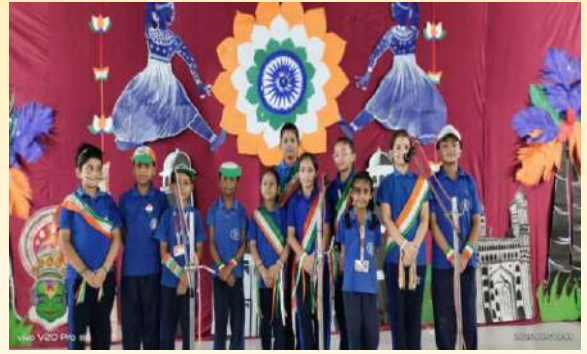
Blue House secured Second Position