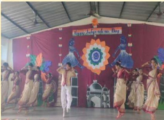
Blue House Stood Second