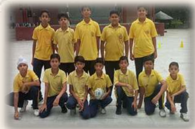
Yellow House Bagged First Position

On 4th July, Inter-house Handball competition for boys grade (6-8) was held in school, where Yellow house bagged First position, Green house won second position and Red house bagged Third position