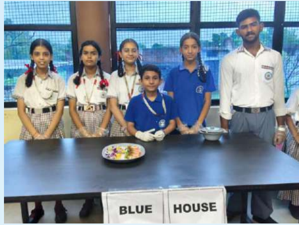
Chefs Of Blue House Attained First Position