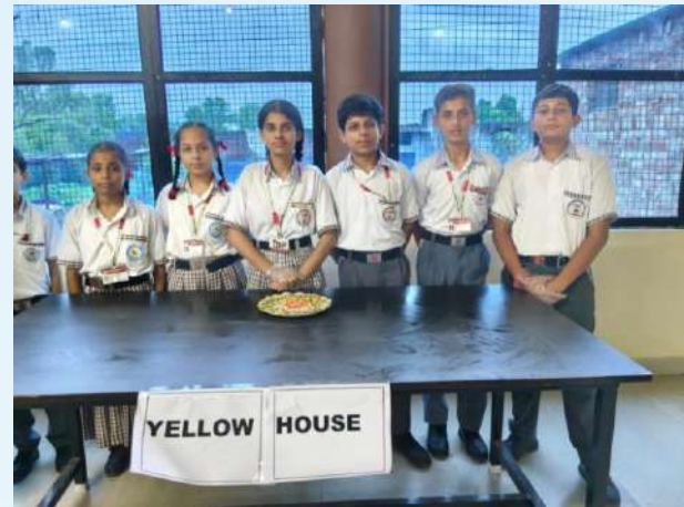
Yellow House Chefs Attained Third Position