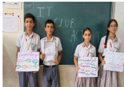
Activity based on Communication Cycle.