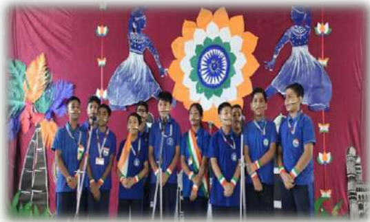
Blue House bagged 1st position