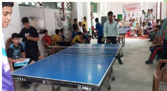
TABLE TENNIS COMPETITION

Under 14, 17, 19 Boys and Girls Table Tennis teams went to KLM school for District level competition.