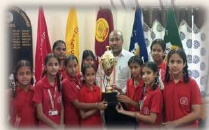
Red House Third position