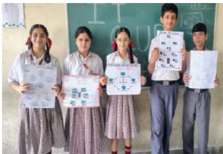
Activity based on Topology .

IT club performed activities on various functions of computer for class (1 to 10)