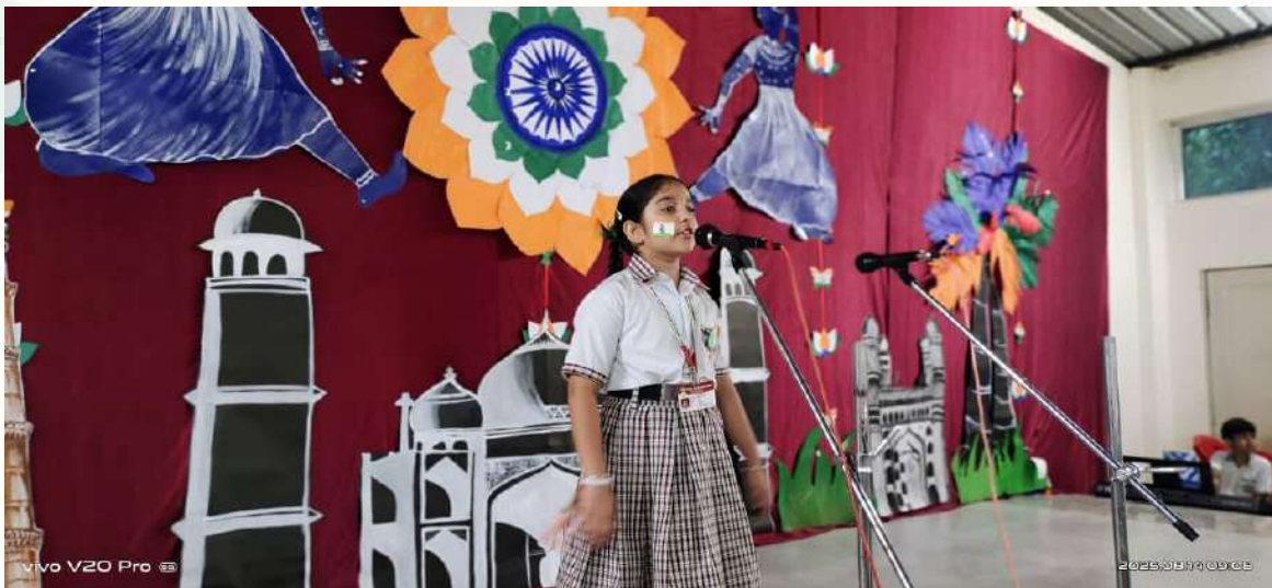
Lavishka (Red House) Stood First