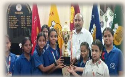
Blue House First Position

On 7th July, Hand ball competition for girls grade (6-8) was held in school campus, in which Blue House stood First, Yellow house stood Second and Red House stood Third.