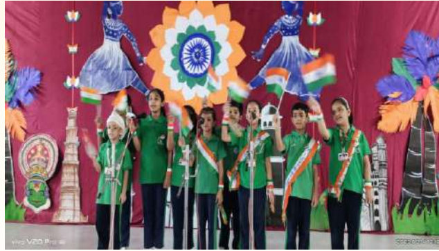
Green House attained Third Position