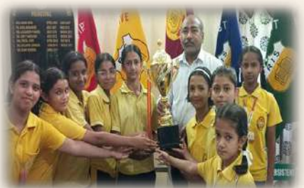
Yellow House Second Position