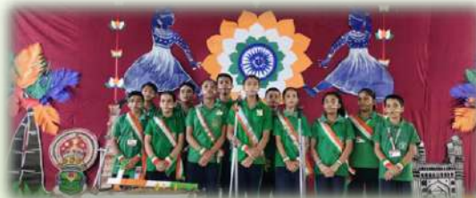
Green House bagged 3rd position