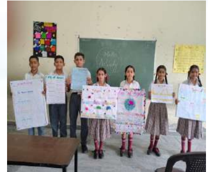
Lines & Angles Activity