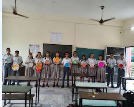
Square root & cube root Activity