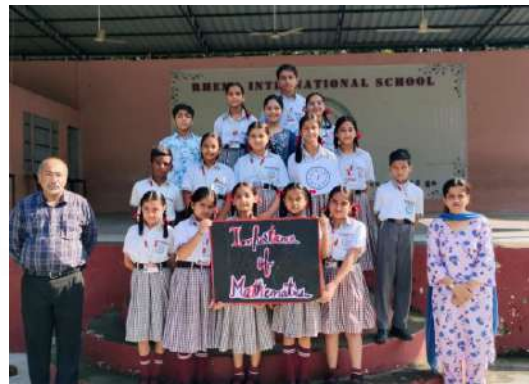
Maths Club Assembly on World Population Day, 14th July