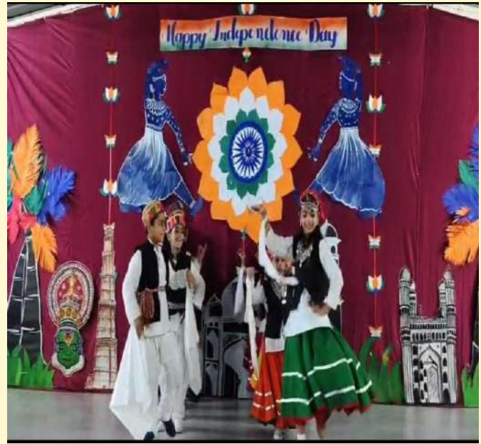
Yellow House Stood Third