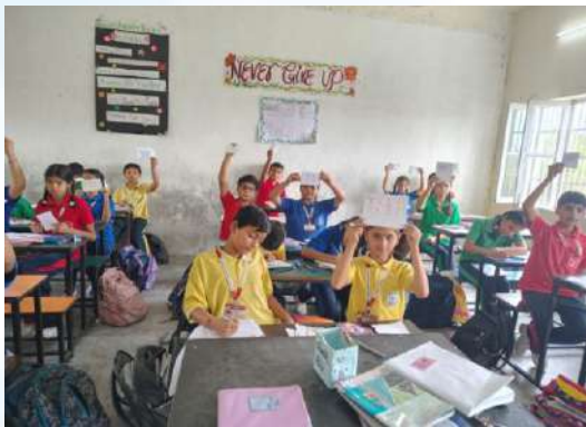
Mirror image activity