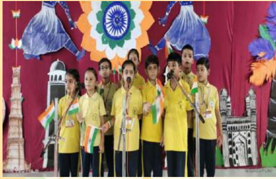
Yellow House got First position