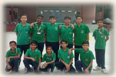
Green House Bagged Second Position